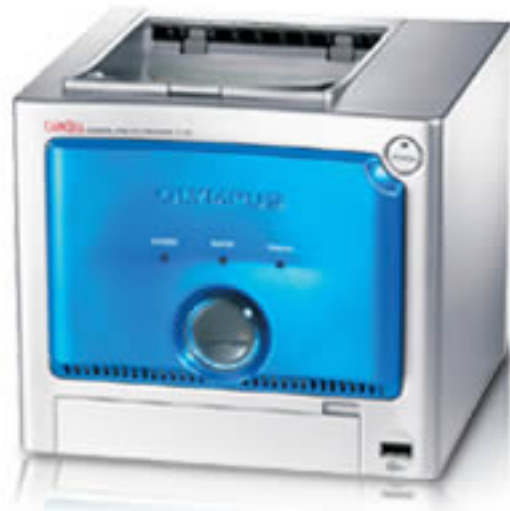
The Olympus P-10 Digital Photo Printer.