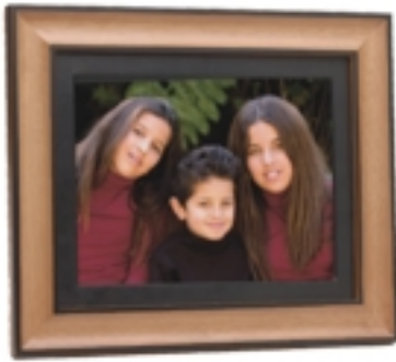
The 8-by-10 USB MemoryFrame retails for $499.

text overlay. The stand-alone MF-810S MemoryFrame has a bright, high-quality 10.4-inch TFT active matrix LCD screen with 800-by-600 resolution. In addition, it has stereo sound and allows users to add voice and/or music to their slideshows. It also features text overlay, and allows captions to be added to slideshow photos.